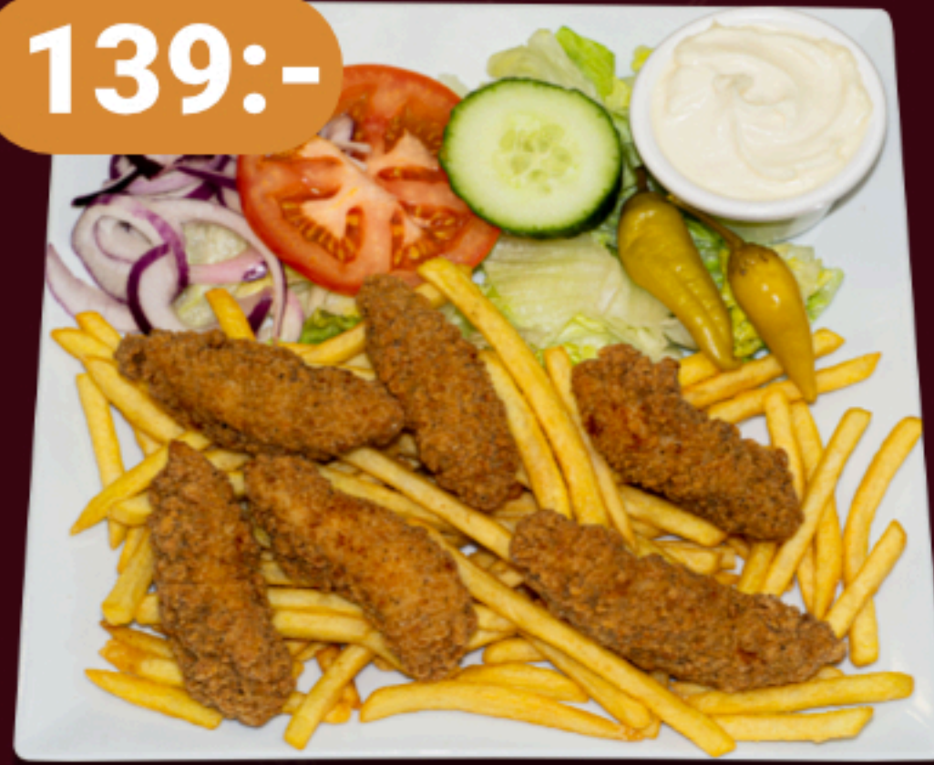
Krispig chicken with ailo