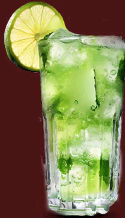
P2 Vaniljvodka, sours apple, sprite