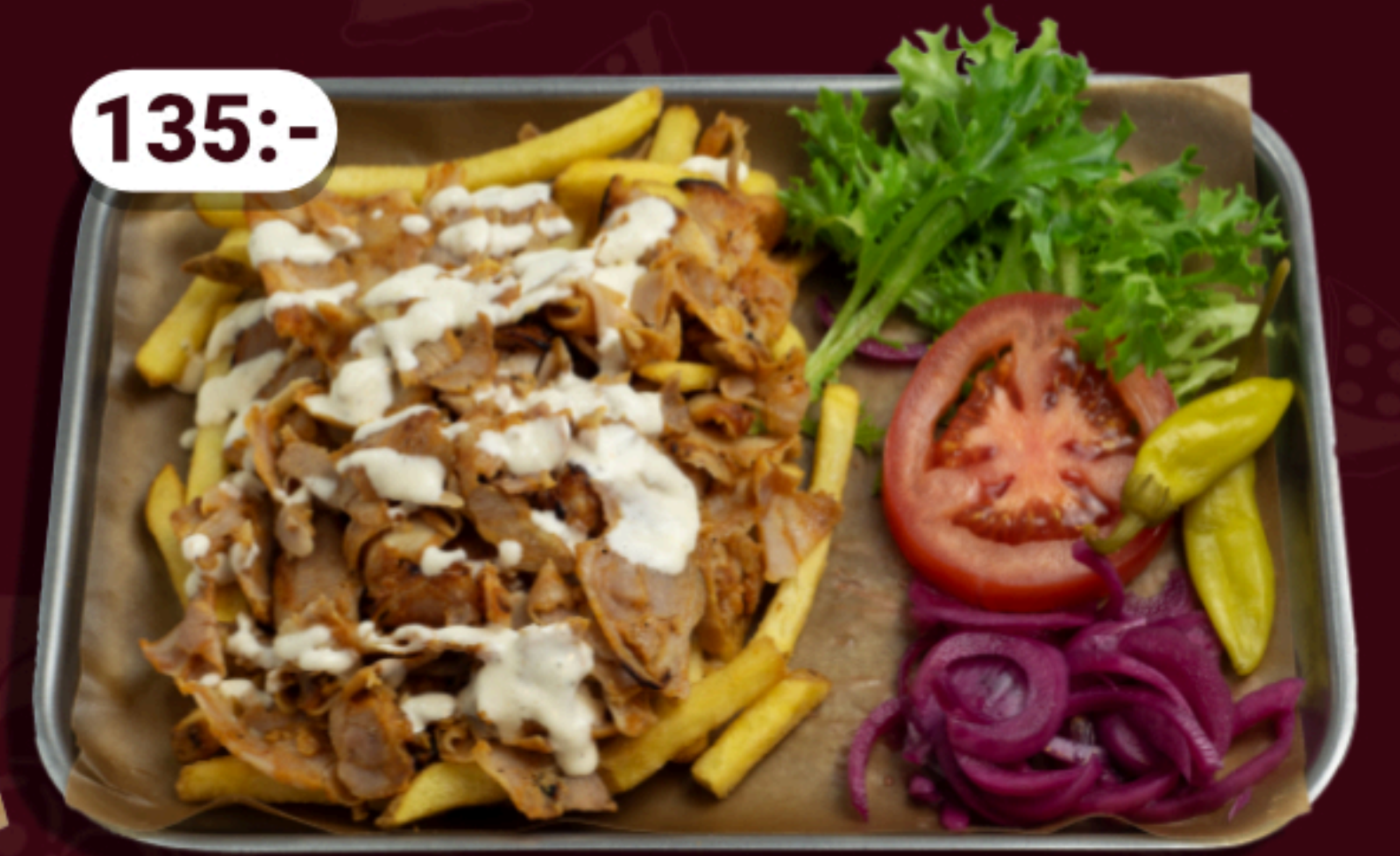
Gyros Platter with mild Kebab sauce