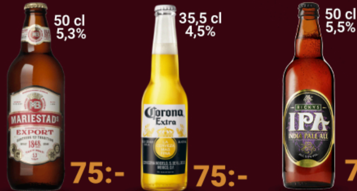
Mariestad Export 75:- Corona Extra 75:- Ipa Rickys 75:-