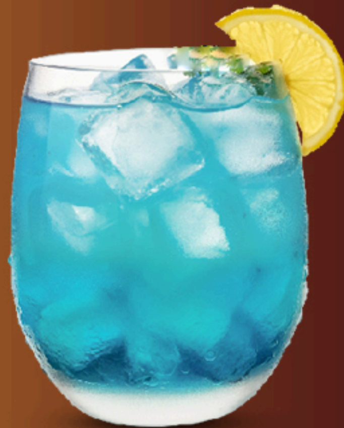
Isbjörn vodka, blue Bols, sprit