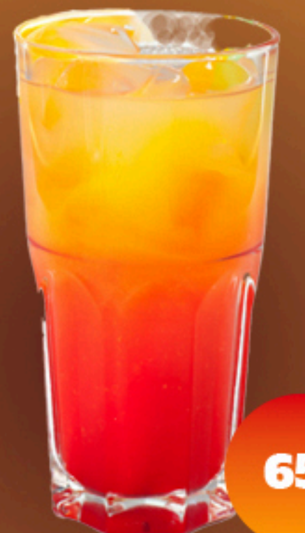
Virgin Mocktails Alchol free