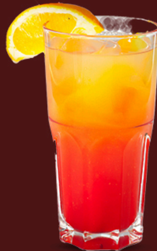
Tequila sunrise Tequila, grendin red, Apelsinjuce