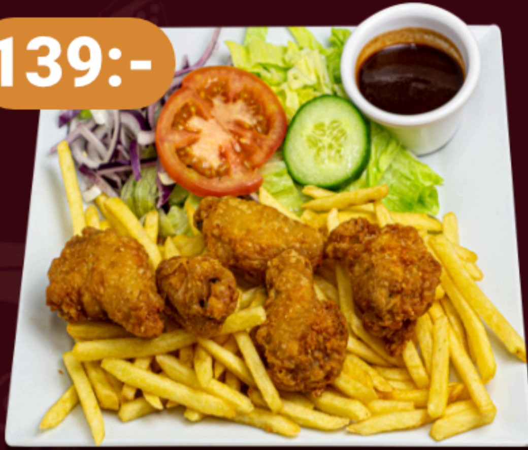
Chicken Wings With BBQ sauce