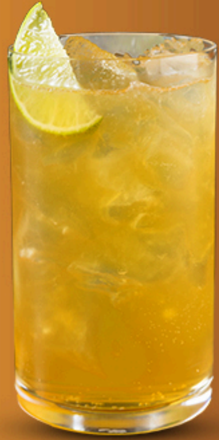
moscow mule Vodka, Ginger beer