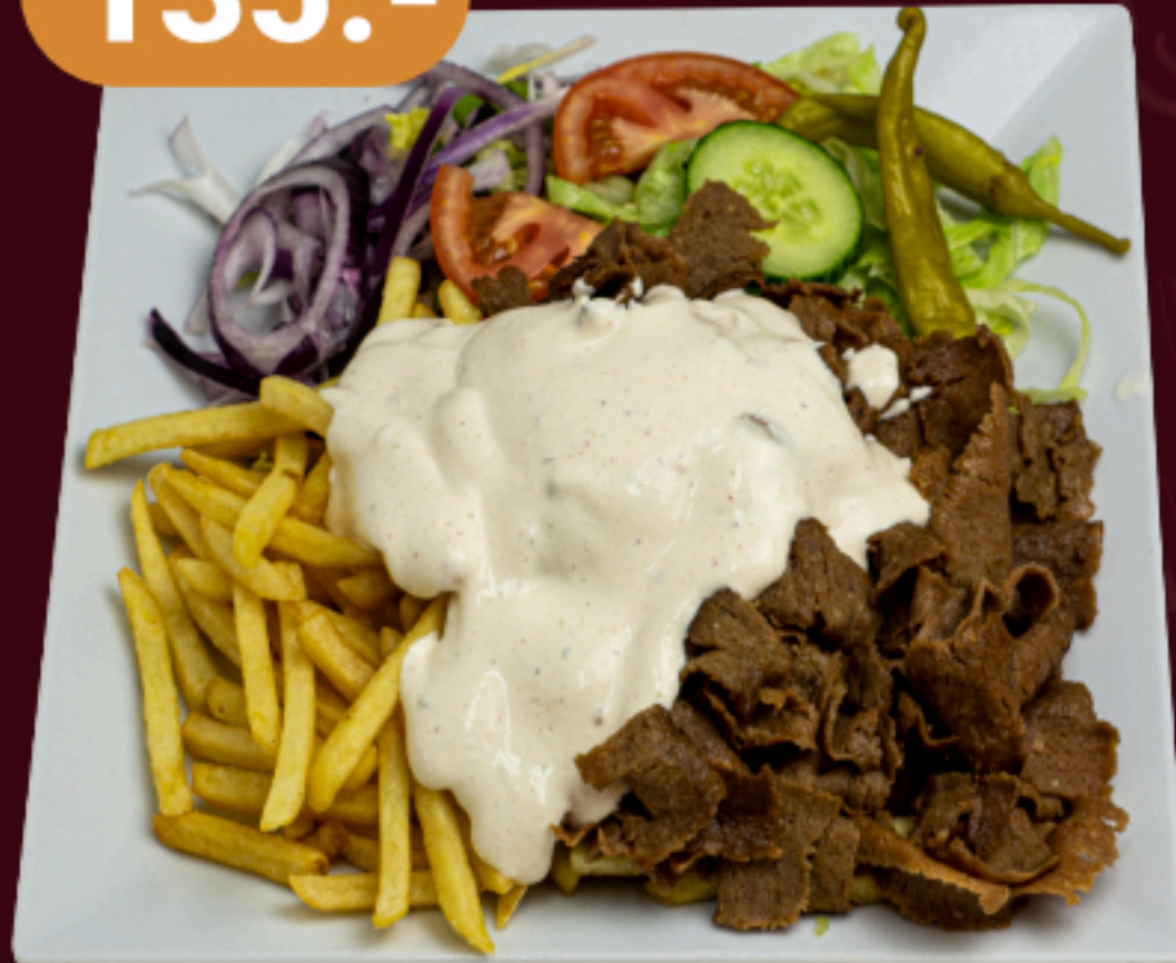
Kebab Platter with mild kebab sauce