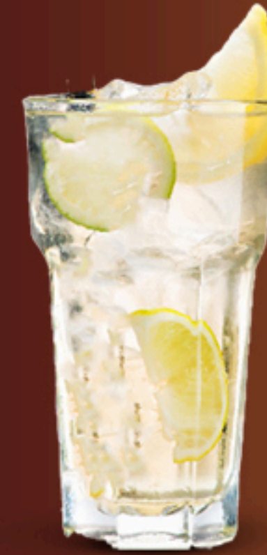
Gin Tonic Gin, Tonic