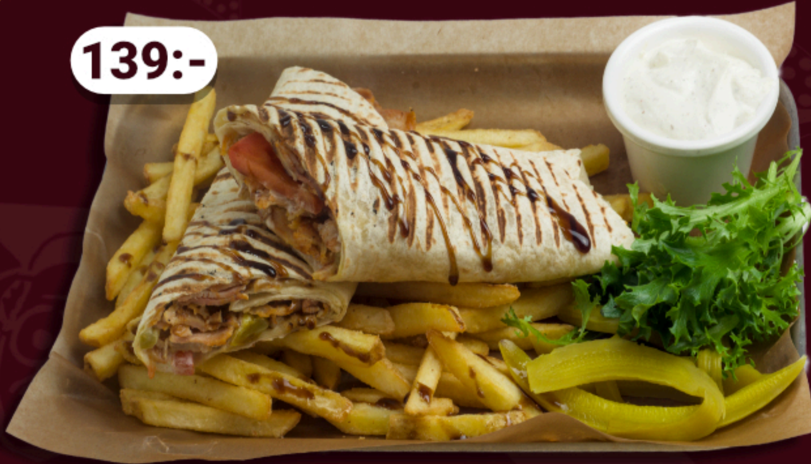
Shawarma chicken shawarma