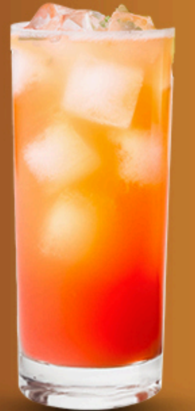
Campari Orange Campari Apelsinjuce