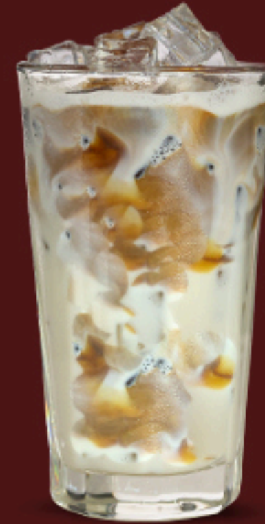
White Russian Vodka, Kahlua, mjölk