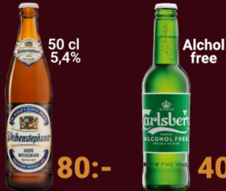
Weihenstephaner 80:- Carlsberg 40-