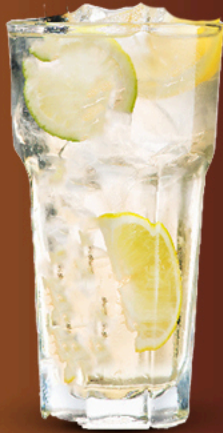
Lennart xante conyac , sprite