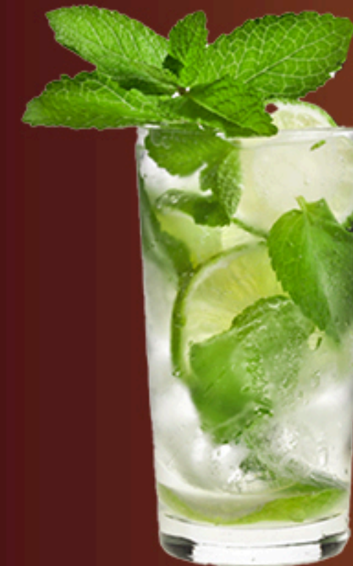
Mojito Bacardi, soda, mint