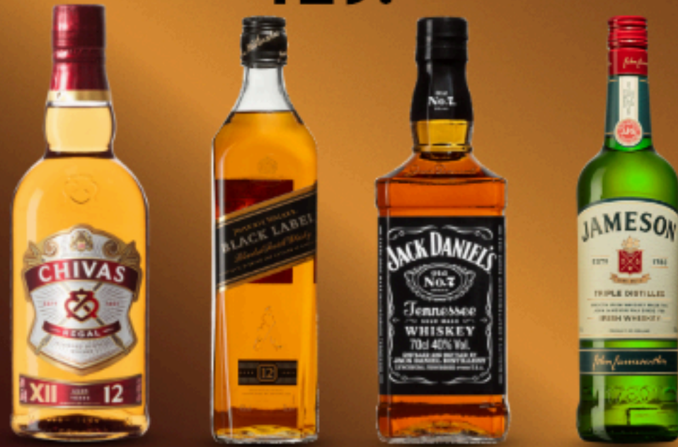
Chivas Regal Black Label Jack Daniel's Jameson