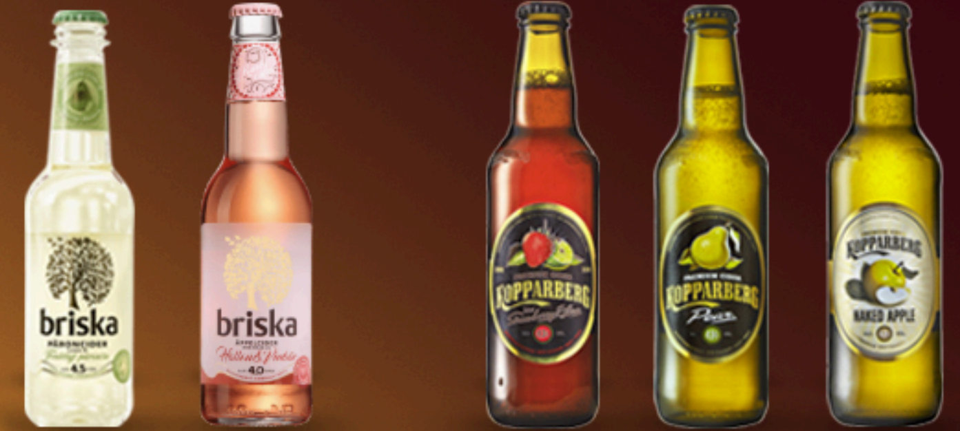
Päron Pear Hallon&vinbär Raspberry & Currant Jordgubb&lime Strawberry & lime Päron Pear Neket äpple Neket apple