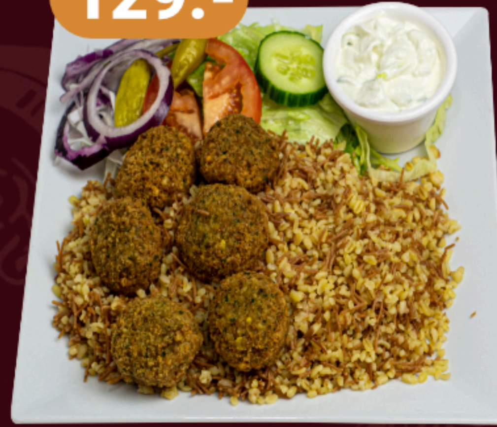
Falafel Platter with ailo