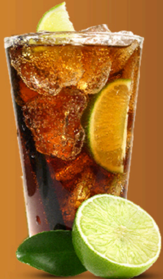
Rom & cola rom, Cola