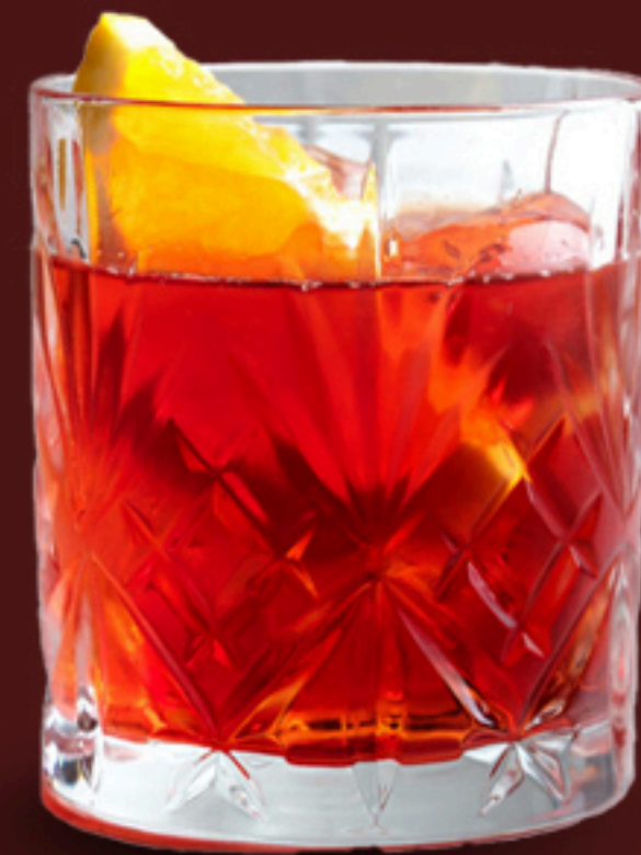
Negroni Gin, Campari, Martini