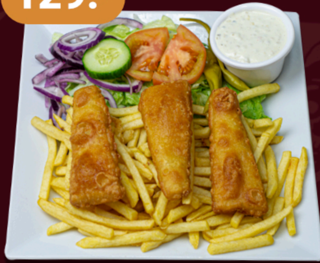
Fish and chips with remoulade