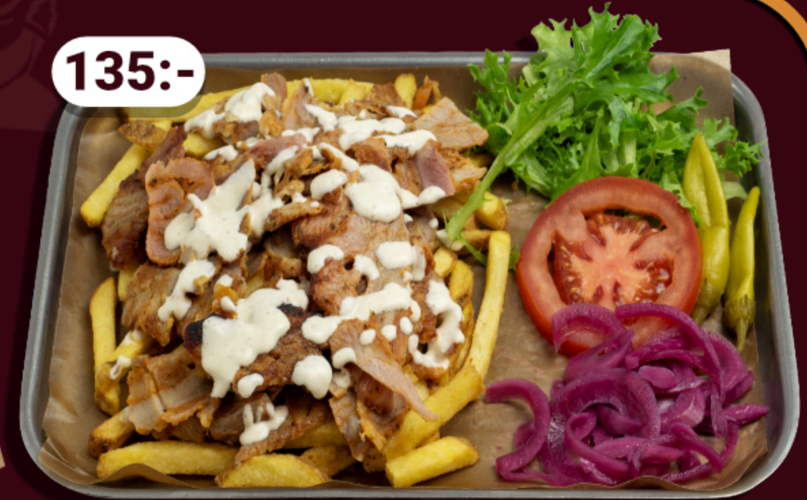
Chicken kebab platter with mild kebab sauce