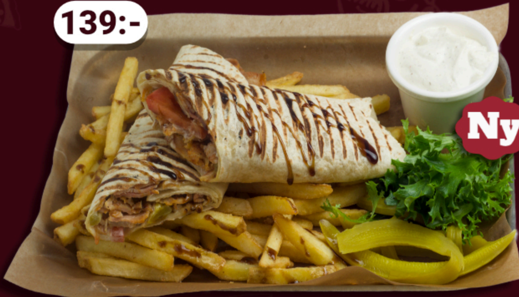
Athens pork shawarma