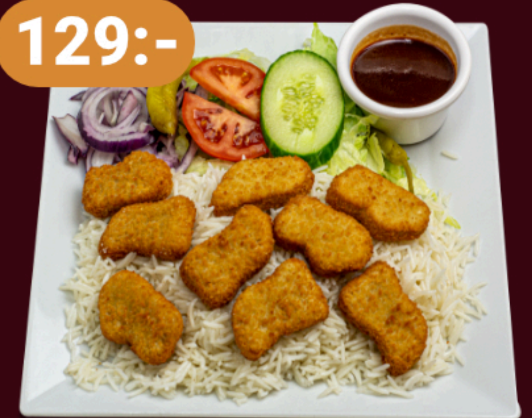
Chicken Nuggets with BBQ sauce